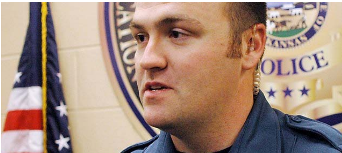
Enlarge photo.