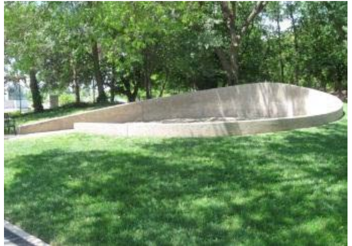
The site of the American Revolutionary War Memorial

Announcing a new Memorial to honor the men and women whose courage and foresight gained independence of the 13 American Colonies from England, creating the United States of America! This memorial will be located in beautiful Veterans memorial Park in Downtown Wichita, within easy walking distance of the City Center. It will join over 15 other spectacular memorials to pay tribute to our defenders of Liberty who have fought for our nation for over 200 years. It will stand as a patriotic tribute with historical