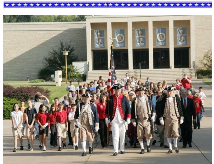
3 The Kansas SAR Color Guard participated in Constitution Day activities at Abilene.